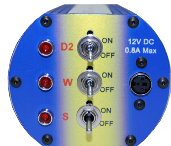
BDS100 Rear View